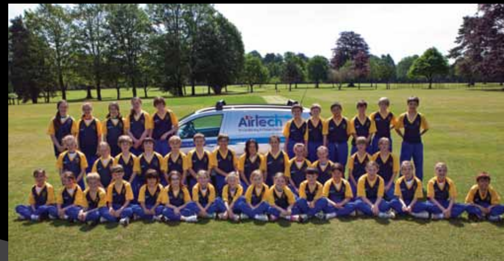
Proud sponsors of the swimming team at Handcross Park School, West Sussex

Climate change, often referred to as global warming, is considered to be one of the greatest environmental threats facing the world today, making the summers in Britain hotter from one year to the next. Air conditioning in offices is no longer viewed as a luxury – these days it is just as essential as central heating is in the winter. All the types of air conditioning/refrigeration systems we supply are totally sealed and installation techniques are such that no refrigeration gas is released into the atmosphere.