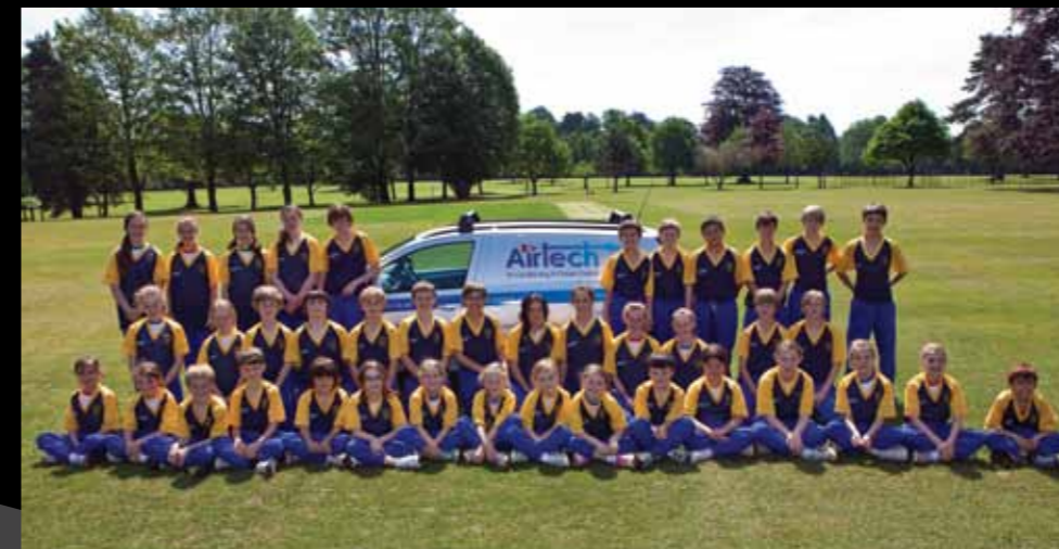
Proud sponsors of the swimming team at Handcross Park School, West Sussex

Climate change, often referred to as global warming, is considered to be one of the greatest environmental threats facing the world today, making the summers in Britain hotter from one year to the next. Air conditioning in offices is no longer viewed as a luxury – these days it is just as essential as central heating is in the winter. All the types of air conditioning/refrigeration systems we supply are totally sealed and installation techniques are such that no refrigeration gas is released into the atmosphere.